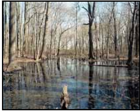
Van Cortland Park

As he worked on this project, Meyerowitz chose to focus especially on those parks