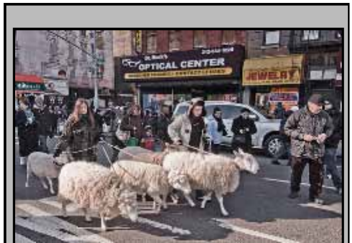
from the PWCC field trip Three Kings Day Parade

I'm hopeful that the DNG format will have a great future and be recognized as an international standard. Many photographers will breathe a sigh of relief if it is. Eventually, the major camera manufacturers may see the light of day and include DNG as a format in their cameras, as Pentax and Leica now do. Whether you decide to switch to DNG is, of course, up to you, but if you do, I believe you will be taking a safer and simpler path in archiving and editing your photos.