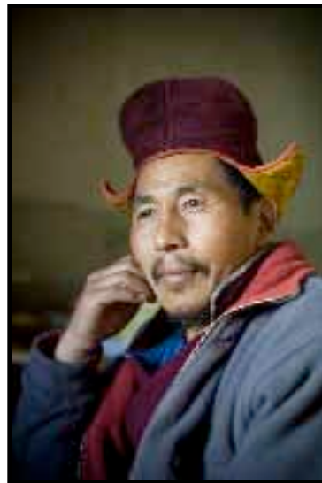
January Print of the Month Serenity, Ladakh