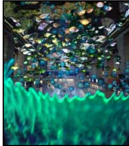
Moon River