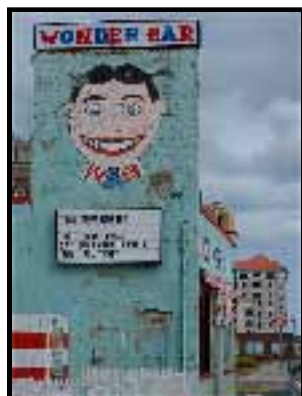
Wonder Bar © Nicole Dosso

Nicole has been involved in many really interesting projects in the City. She was involved in the building that was Bear Stearns' World Headquarters (completed in the late '90s) as well as the UBS Warburg trading floor facility in Stamford, CT, which was the largest trading facility at the time it was completed in 2002. She was also involved in the redevelopment of 7 World Trade Center, which was the