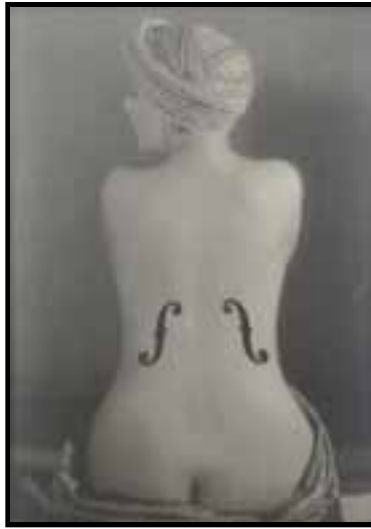
Le violon d'Ingres