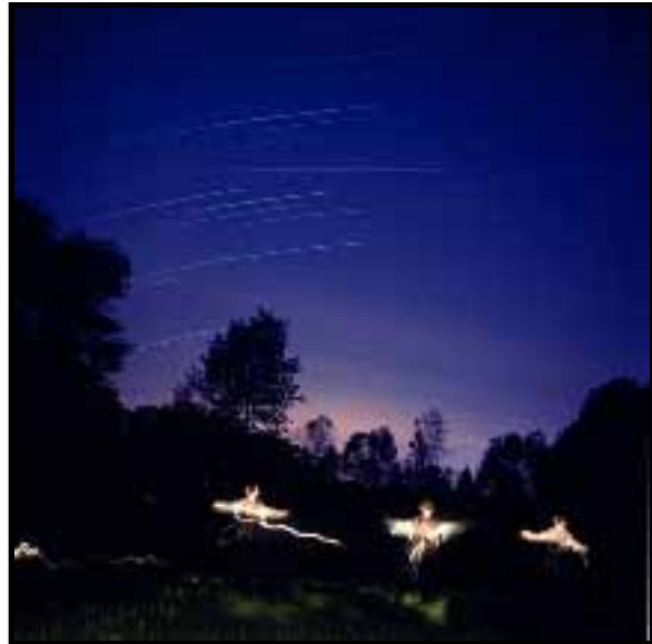
Three Ghosts